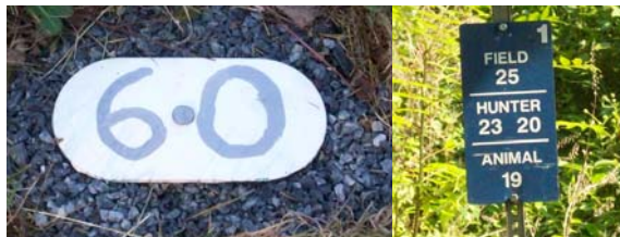
Examples of yardage markers in the ground and target number signs with yardages. Each course has its own color.

Each of these fine courses are numbered and color coded at shooting positions and target butts, with signs that have target numbers and all yardages listed for Field, Hunter, and Animal distances. All yardage markers are colored coded and marked to match the yardage signs at each target and are placed in the ground using concrete cylinders and/or steel plates.