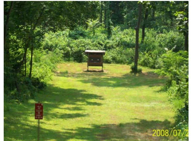
Wide shooting lanes and an example of the target sign and target butt.

The Mechanicsburg Archers will also be holding a Penn-Dutch League shoot June 20 & 21, 2009. This shoot is 14 Field & 14 Hunter Targets both days. This is a casual registration shoot from 7:00 A.M. to 11:00 A.M. both days.