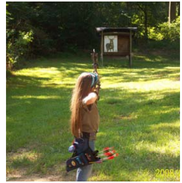
Youth at PSAA Animal Shoot. Target butts made of Celotex.

Our permanent courses have target butts made out of Celotex. Sometimes, depending on the type of arrows shot, this Celotex can leave a small residue on the shaft. Using an arrow lubricant to help prevent sticking and sometime even a steel pot scrubber to remove the residue can be beneficial.